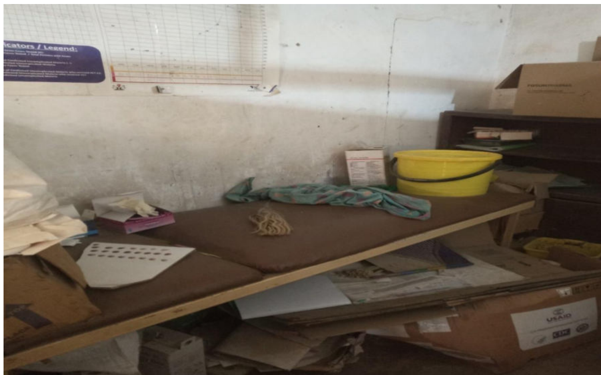
Pic. 3: Labour Room at Durumin Danwake PHC, Gwale LGA

In 2016, the United States Centers for Disease Control and Prevention (CDC), in collaboration with the Nigeria National Malaria Elimination Program (NMEP), established the Malaria Frontline Project (MFP), a three-year intervention project with the goals of strengthening the LGAs' health workers technical capacity, improving malaria surveillance, and facilitating evidence-based decision-making in malaria control and prevention.