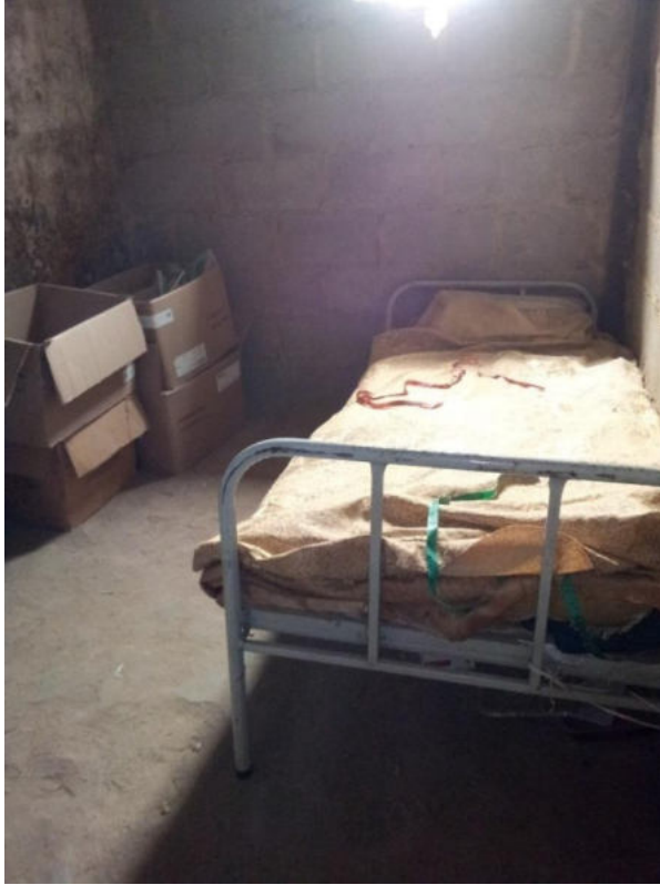
Pic. 1: Delivery Room in Danbare PHC at Kumbotso LGA, Kano

The study therefore recommends allocative efficiency and timely disbursement of budgetary resources for the PHC management to address infrastructure deficit, HRH, capacity building and optimal functionality challenges. Secondly, increase community awareness initiatives on citizen's rights to standard healthcare and the services available at the PHCs. Lastly, institute supportive supervision and respond to the interventions from the Government, facility staff and CSOs by visiting the facility promptly as needed.