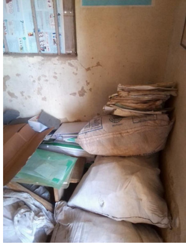
Pic. 2: Record Room at Wailari PHC, Kumbotso LGA, Kano