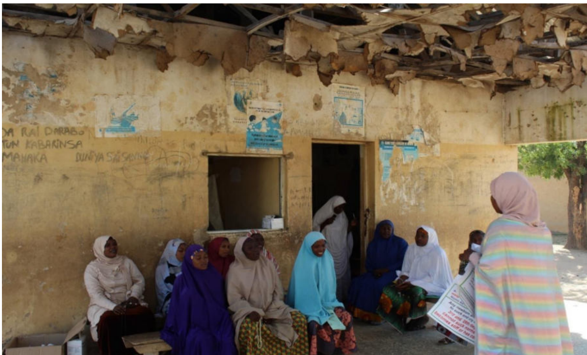
Pic. 4: Pregnant Women Receiving Antenatal Lessons at Zara PHC, Kumbotso LGA