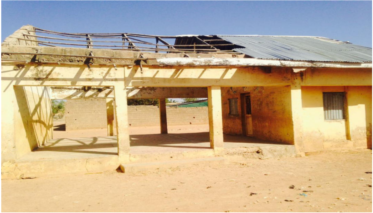
Pic. 5: Zara PHC Building, Kumbotso LGA, Kano