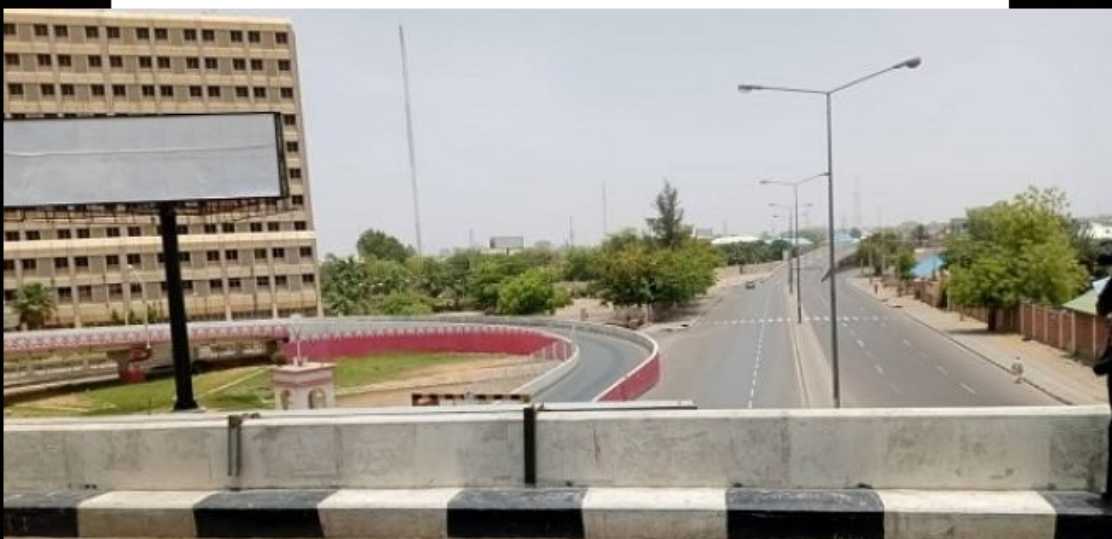
The ever-busy Kofar Nassarawa Flyover overlooking the equally busy Ibrahim Taiwo Road, looking deserted while Kano was under the lockdown