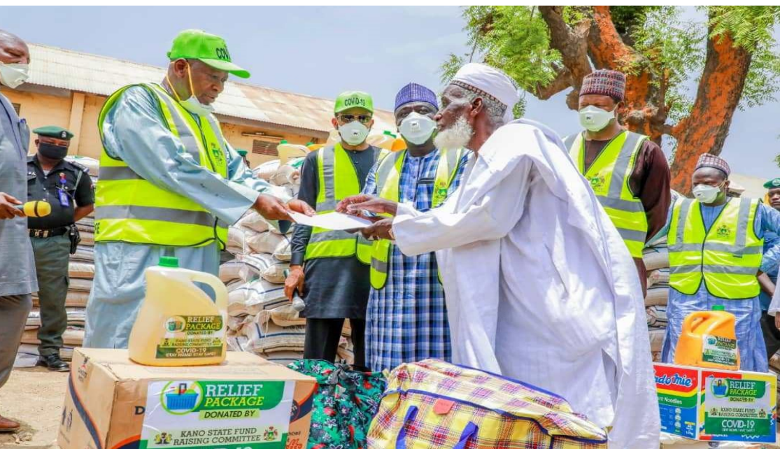
Governor Abdullahi Ganduje handing over a palliative package to an elderly man during the first batch of the palliative distribution exercise in April

administration of the palliatives deducted from the N2000 cash payment meant for the hapless beneficiaries.