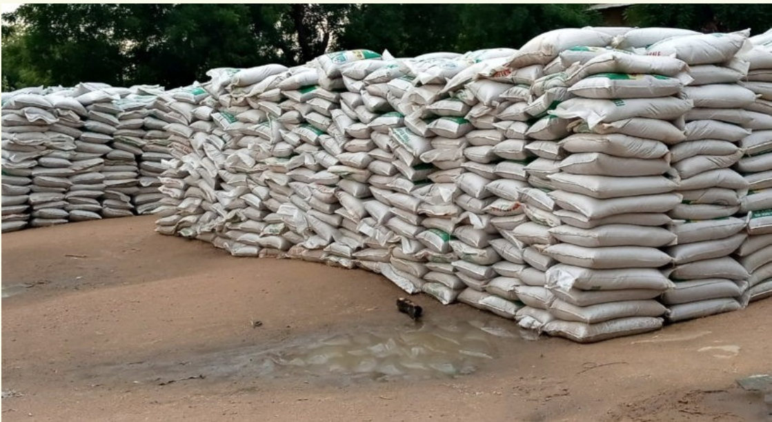
Grains donated by federal government alleged to be rotting away under rain and sun in Kano, before commencement of their distribution.

palliative distribution plan, or at least, ensure the inclusion of their representatives in the state-level fundraising committees, as well as the respective LGA and ward level distribution committees. That is the only way the government could have guaranteed them the opportunity to benefit from their well-deserved share of the palliatives. Failure to do so resulted in many of them being denied the opportunity to benefit from the palliatives during the current COVID-19 pandemic. The obvious lack of inclusion of these categories of citizens amounts to marginalization and discrimination on the grounds of their vulnerabilities. This is against the spirit and letters of the Nigerian constitution and international human rights instruments.